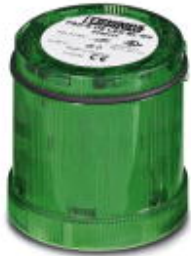
LED blinking light element, 24 V AC/DC, green

Please be informed that the data shown in this PDF Document is generated from our Online Catalog. Please find the complete data in the user's documentation. Our General Terms of Use for Downloads are valid ( http://phoenixcontact.com/download )